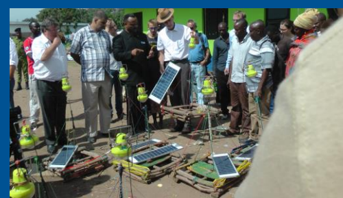
Würzburg - Mwanza