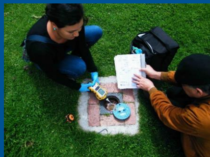
Stuttgart - Bogotá

measurements to examine the grade of contamination of a formerly used industrial site