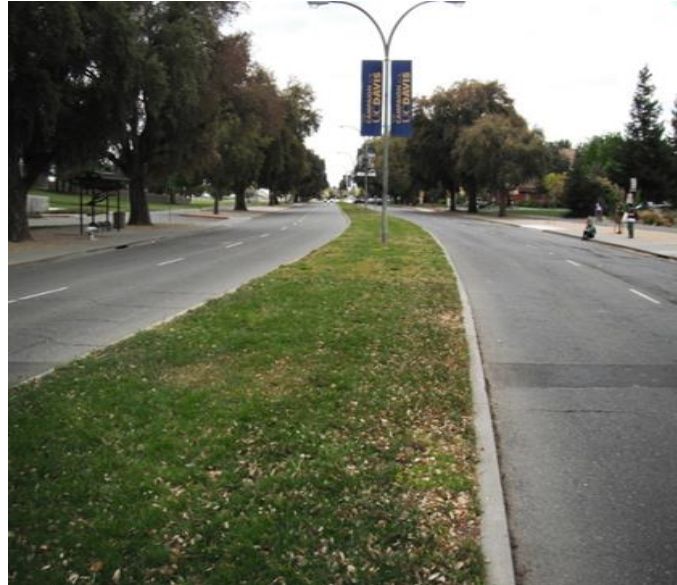
Replacing dysfunctional street light