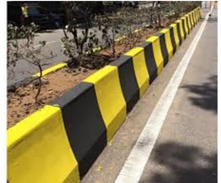
Painting the kerbs with florescent paint