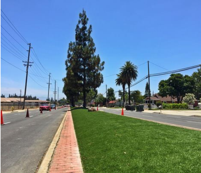
Tree planting and greening of the median with grass and trees