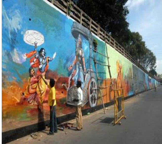
Decorating street walls – historic paintings