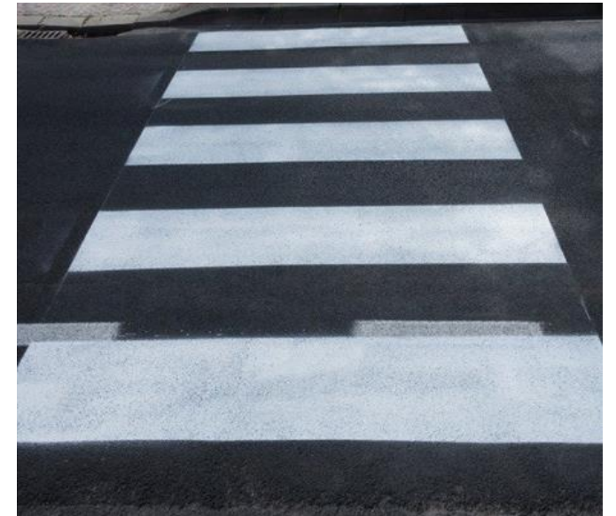
Providing zebra crossing