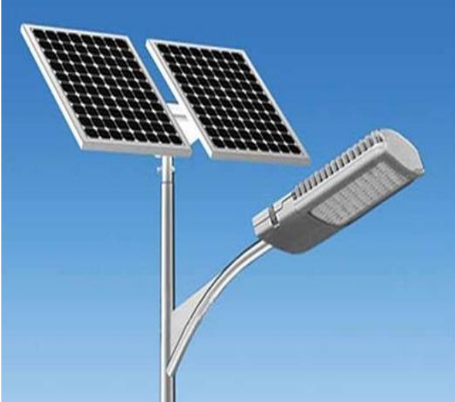
Provision of solar-powered street light