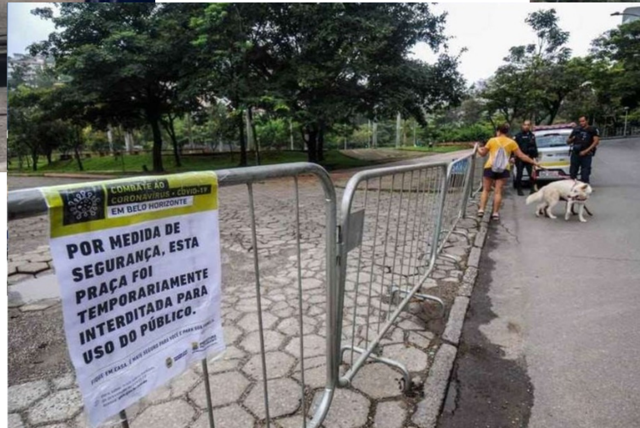
Closure of public squares