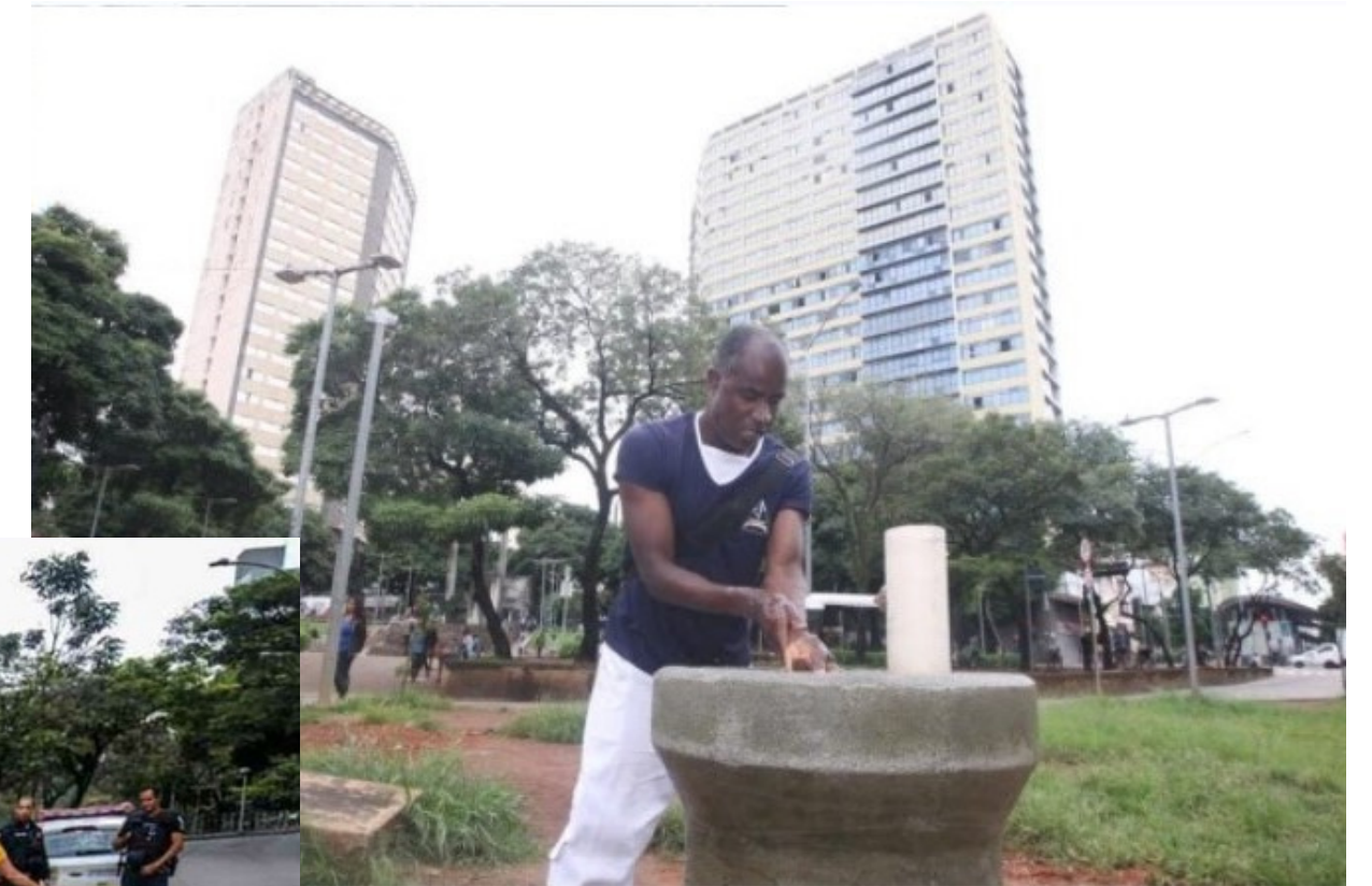
Sink in a public square