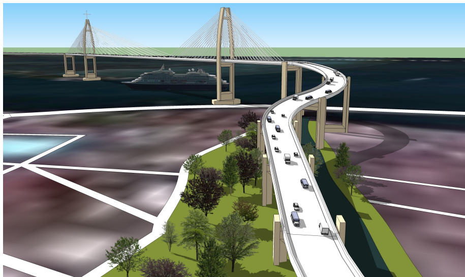
CEBU - CORDOVA BRIDGE