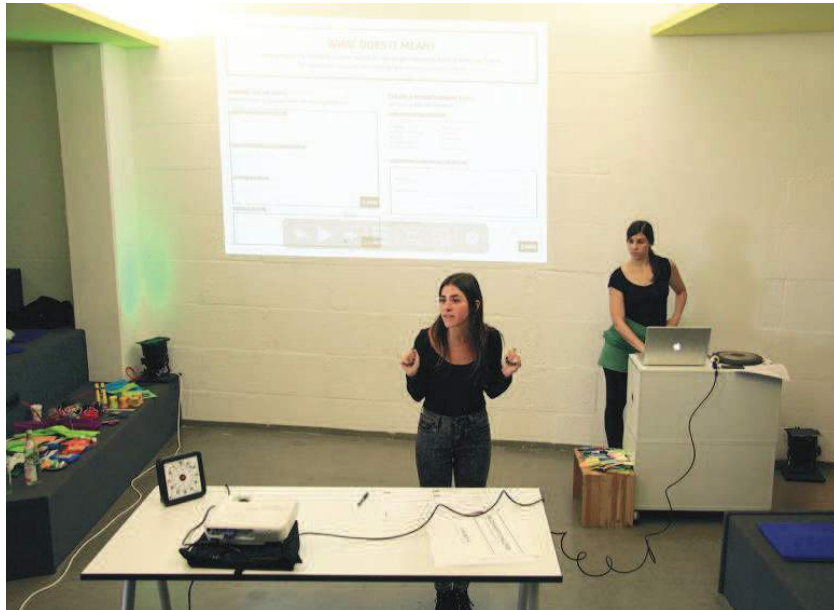
Design Thinking workshop at Social Media Week