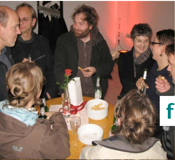
face to face