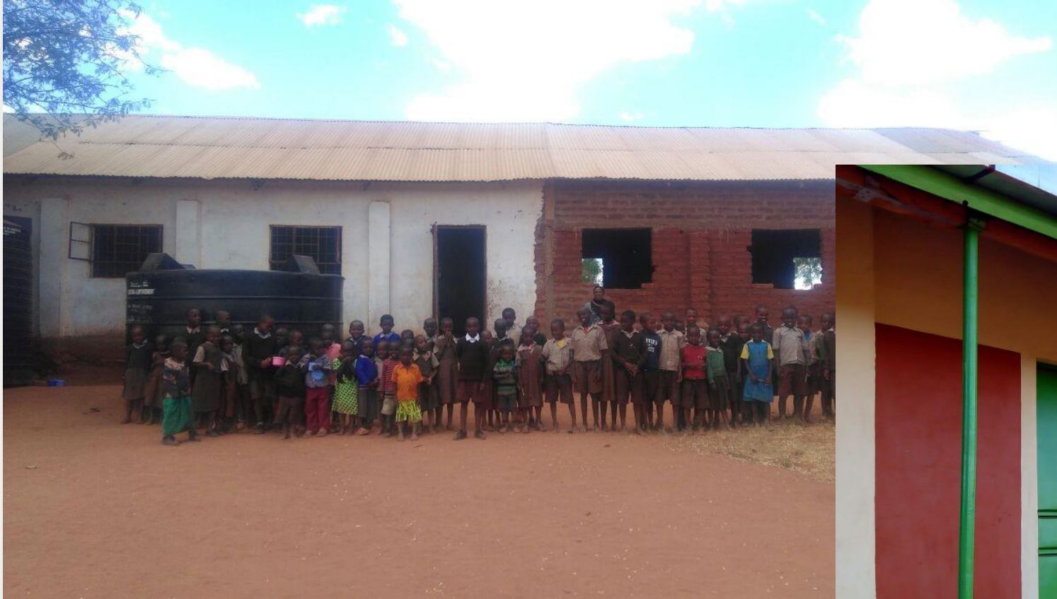
Kaasya Primary School, Kenya

Eine Initiative der kommunalen Spitzenverbände