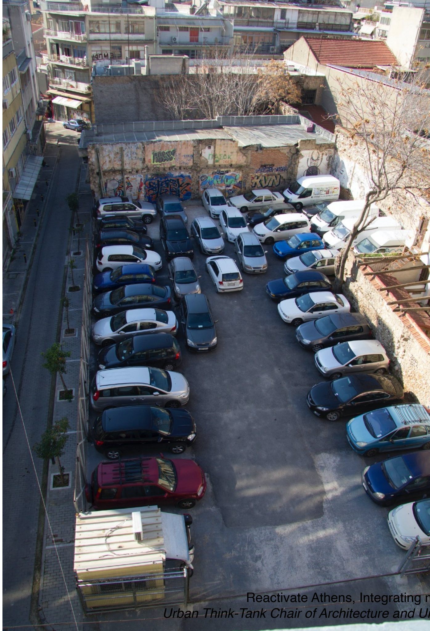
Reactivate Athens, Integrating mobility and public space Urban Think-Tank Chair of Architecture and Urban Design, ETH Zurich