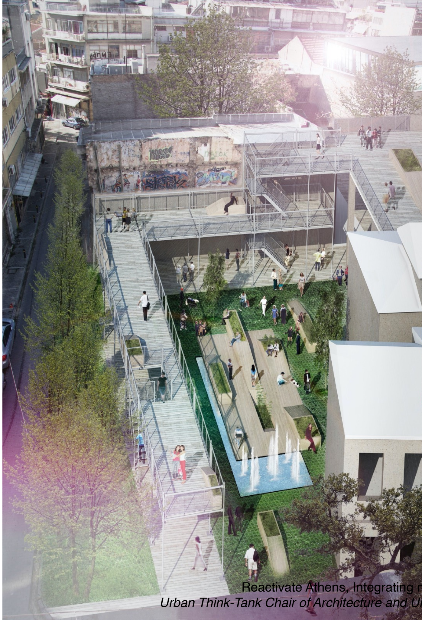
Reactivate Athens, Integrating mobility and public space Urban Think-Tank Chair of Architecture and Urban Design, ETH Zurich