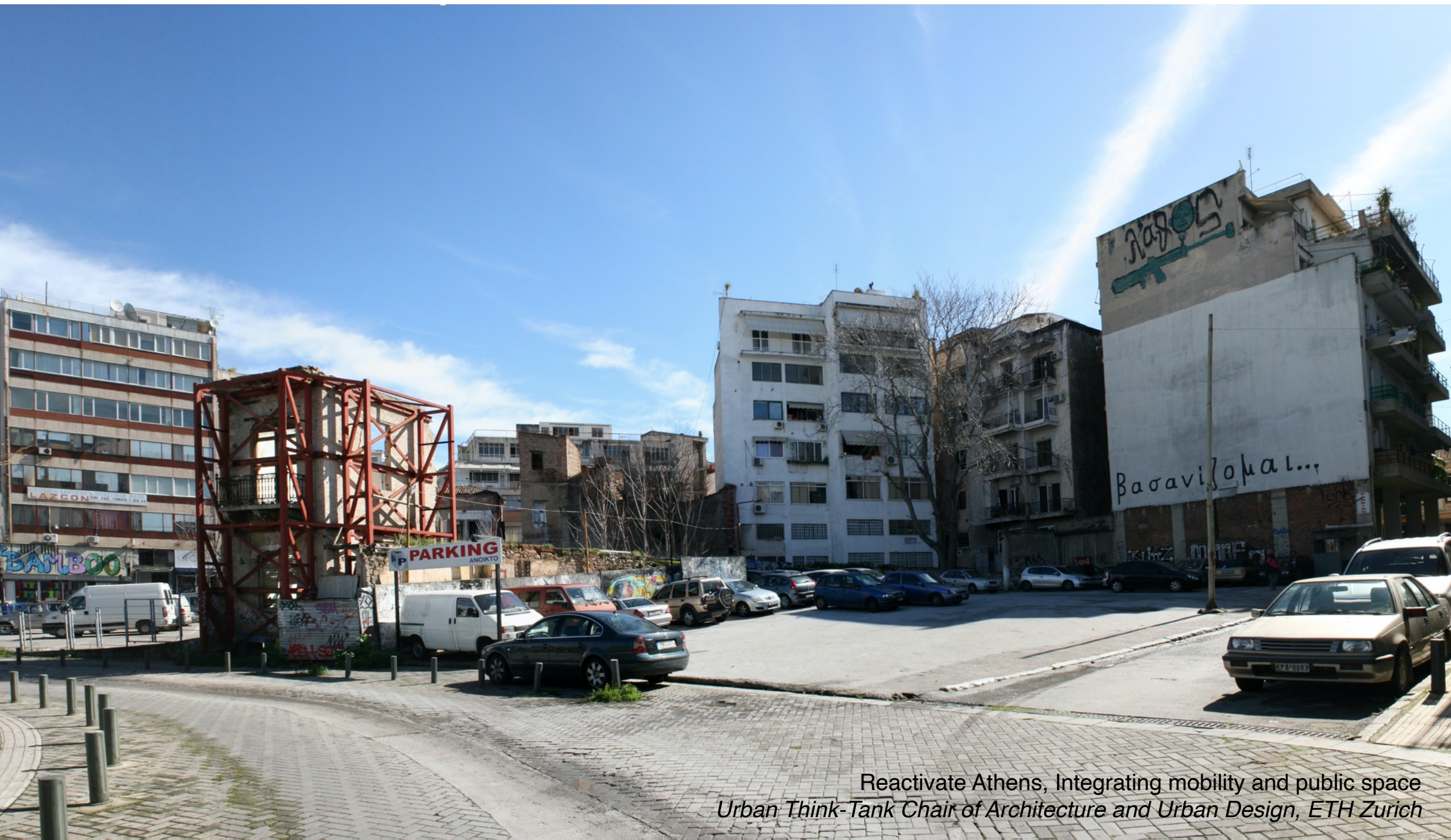
Reactivate Athens, Integrating mobility and public space Urban Think-Tank Chair of Architecture and Urban Design, ETH Zurich