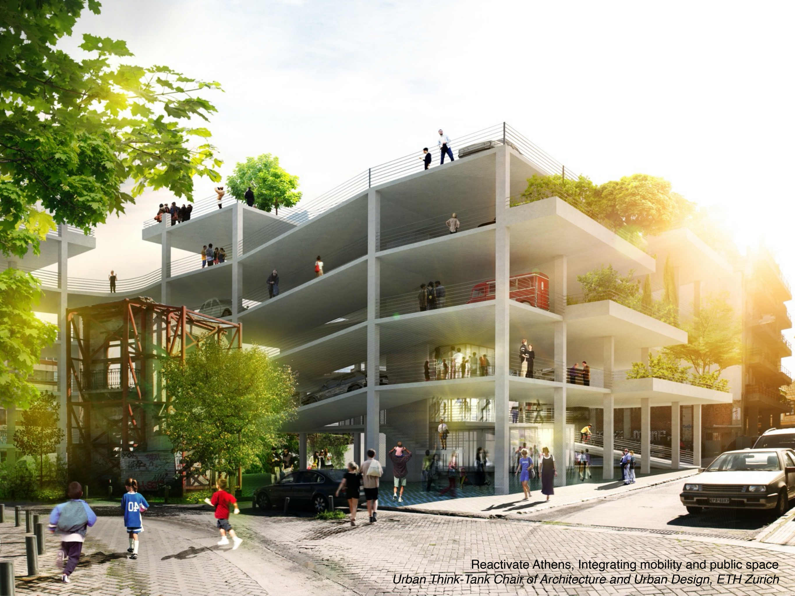
Reactivate Athens, Integrating mobility and public space Urban Think-Tank Chair of Architecture and Urban Design, ETH Zurich