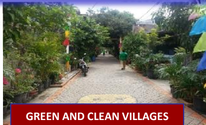
GREEN AND CLEAN VILLAGES