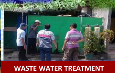
WASTE WATER TREATMENT