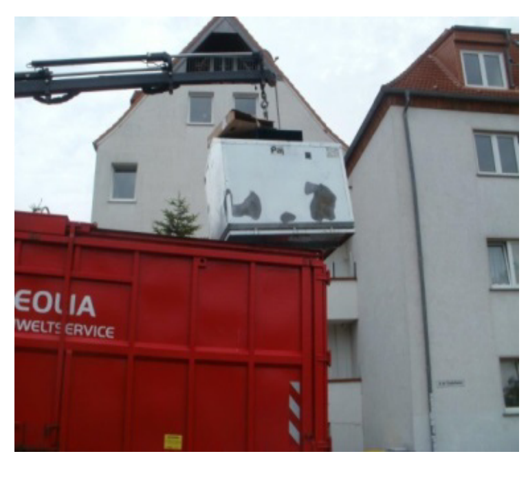
Containers are emptied using the hook-lift hoist system