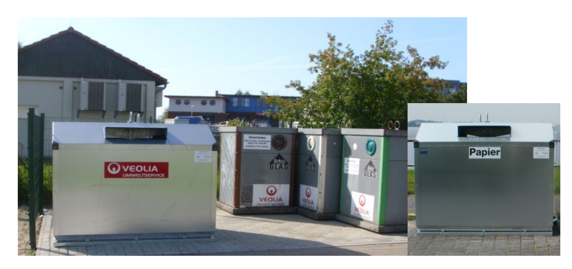
Recycling collection point for paper and glass Container for paper