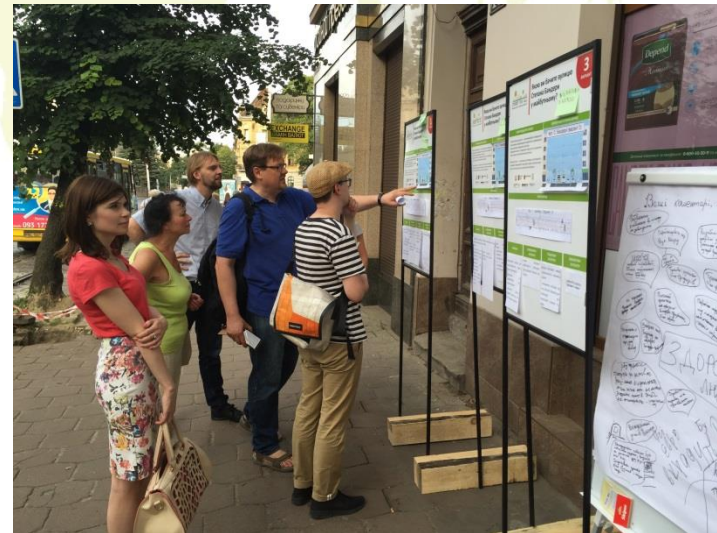
Workshops in May and June 2016 @Leipzig City Council