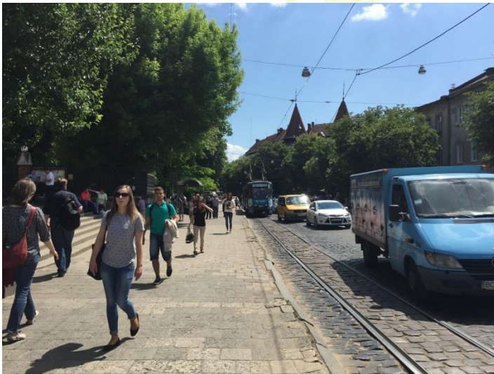
Stepan Bandera Street @Leipzig City Council

Leipzig City Council, Traffic Civil Engineering Office