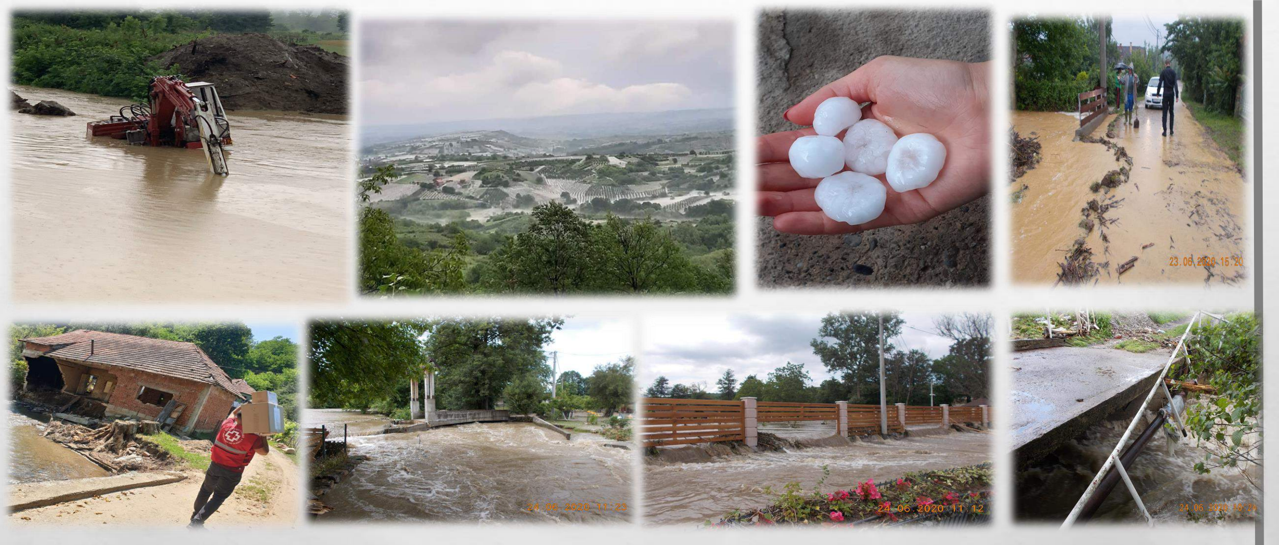
In addition to the pandemic of the COVID-19 virus, in the territory of the city of Kruševac, in the period between the state of emergency and emergency, we had floods, fires and open fires.