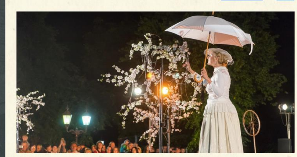
On Sunday, May 17, an open-air performance will take place in several districts of Lviv.

The Institute of Cultural Strategy will organize an open-air mobile performance